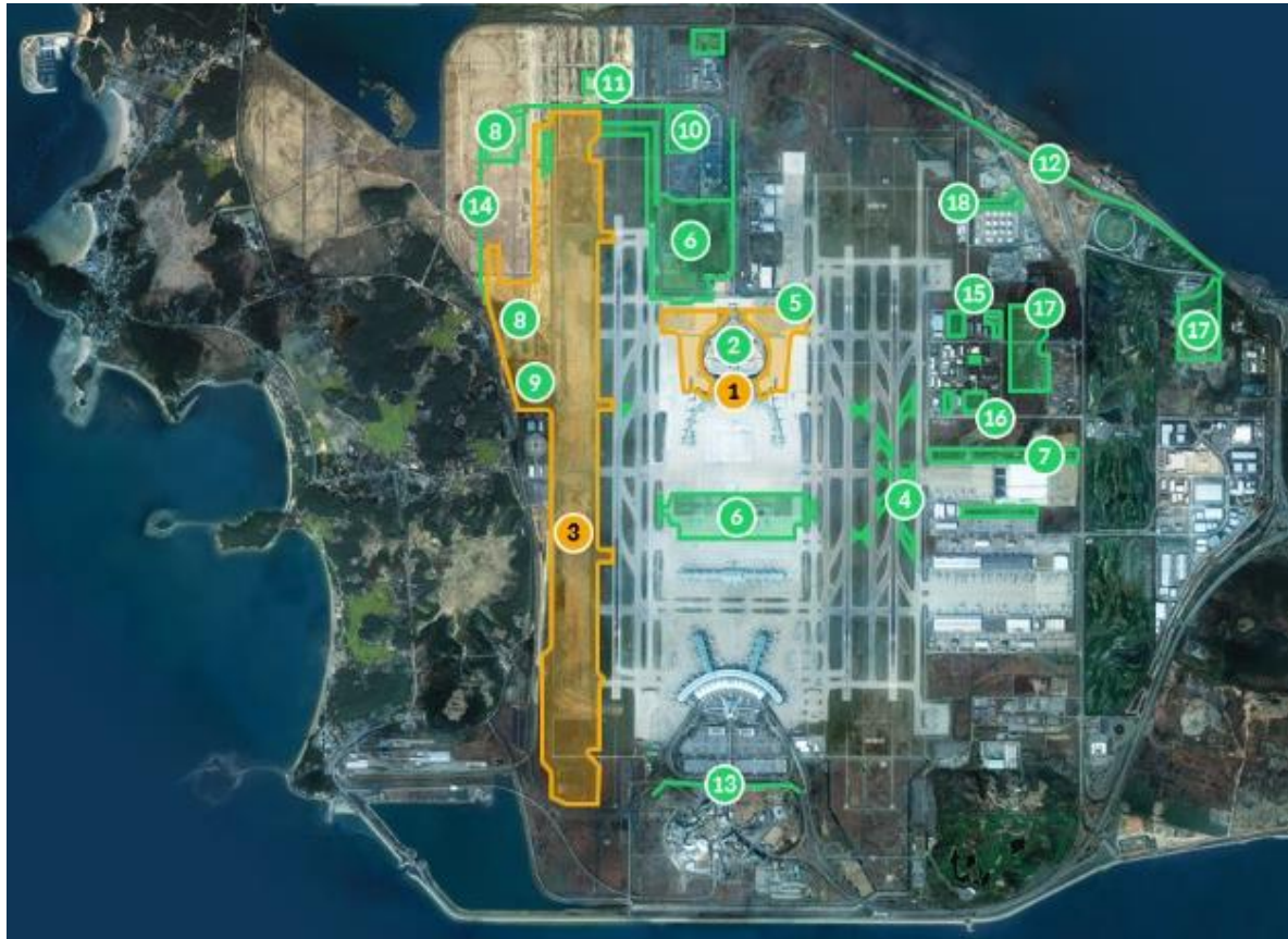
[Phase 4 Construction Status]